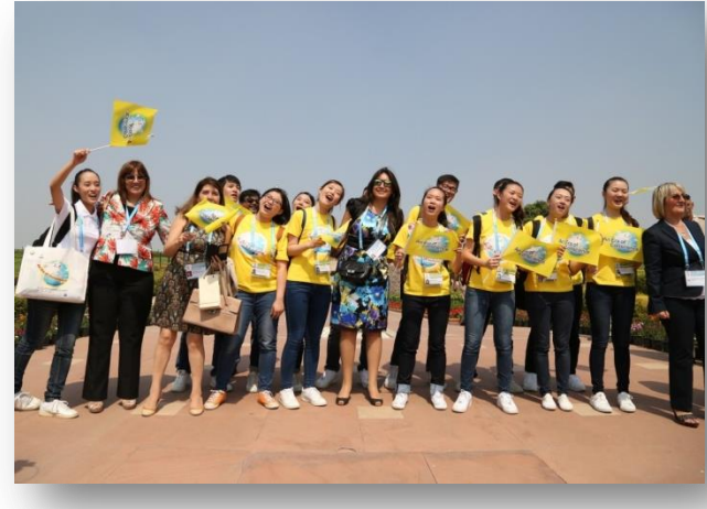
International volunteers put together a flash mob outside of Mahatma Gandhi's mausoleum. They sing the Love and Peace Song to break down language barriers. Attracted by their songs and hearts, judges from Paraguay who don't speak English even step out to join the volunteers.