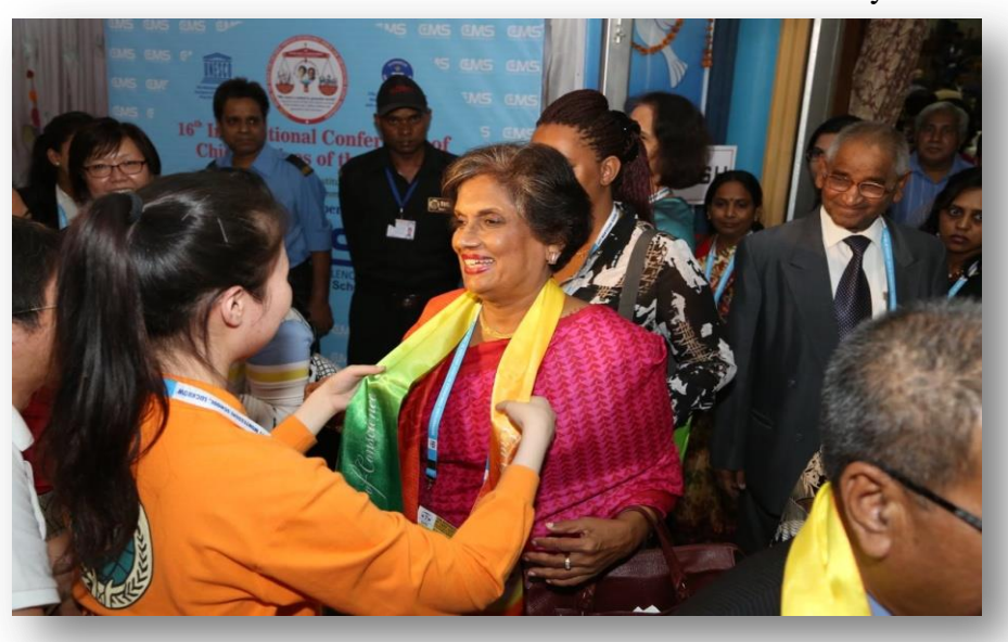
The volunteers of "An Era of Conscience" share the movement with the former president of Sri lank, H.E. Chandrika Kumaratunga, and present Her Excellency the scarf of conscience.

Conscience can help not only South Africa but all countries because conscience really means that all of us are able to draw the connection between what we say, what we do, and the possible consequences because many times we hit the wars with our wits, many times we hit with our actions. So conscience is important from that point of view, and I think all of humanity should embrace it.