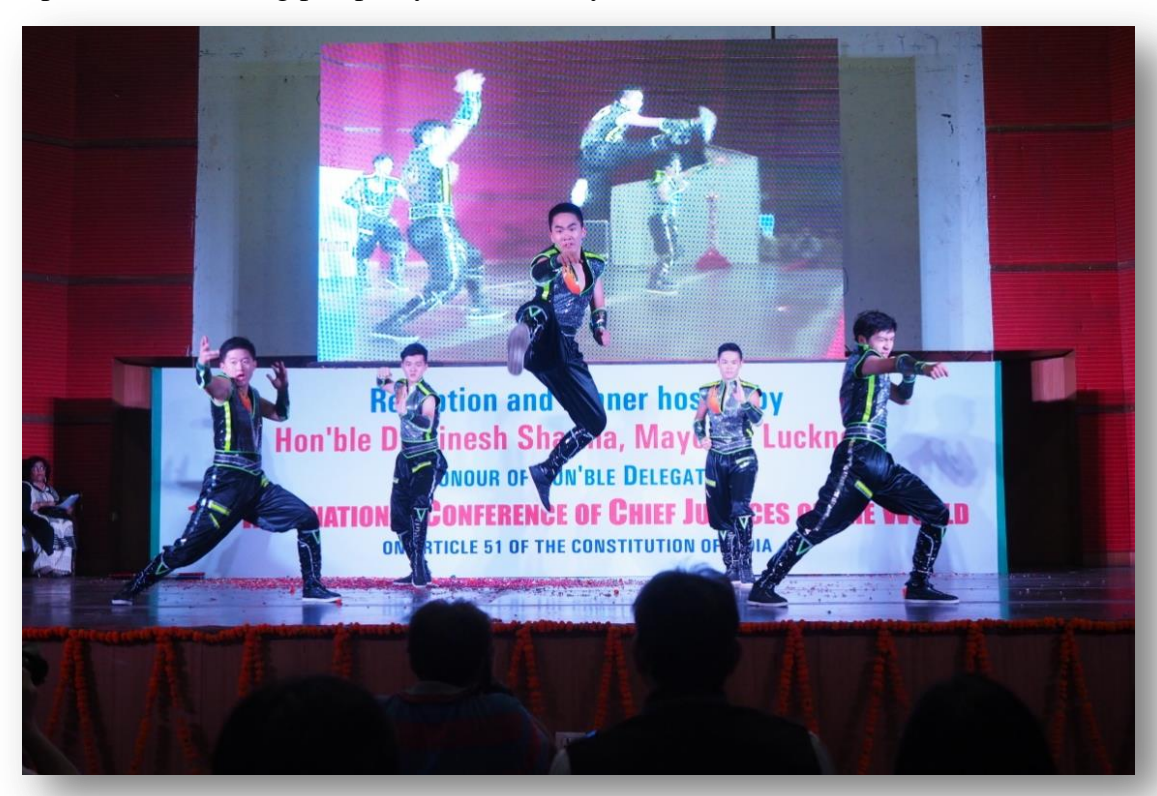
A group of teenagers growing up practicing Tai Ji Men's martial arts demonstrates the spirit of protecting our conscience and justice as knight-errant of justice.