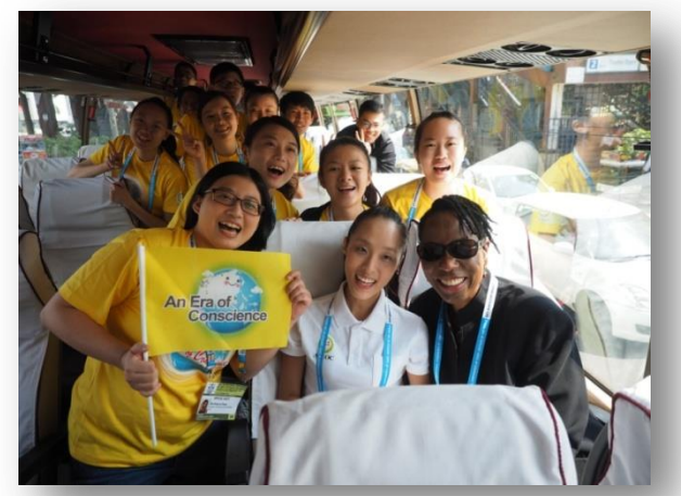
International volunteers of An Era of Conscience touch the heart of the former chief justice of Panama with their joyful singing on the bus.

In the 16th International Conference of Chief Justices of the World, international youth volunteers from Federation of World Peace and Love, Association of World Citizens, and Tai Ji Men Qigong Academy spread neverending energy around and during the conference. They use their energy to bring laughter and happiness to everyone in everywhere they go. They not only learn from those judges of 60 different countries, but also use love to interact, share and discuss the idea of love and peace with each other. Every smile and hug connect their hearts more closely. They cross the language barrier to build up cross-generation friendships.