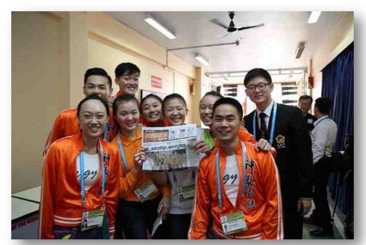
International volunteers for the movement of "An Era of Conscience" show confidence and enthusiasm of the youth in promoting An Era of Conscience. They share happily their life stories on the front page of India's newspaper.

Volunteers of Cultural Goodwill Group of Love and Peace demonstrate the confidence and passion of the new generation, and receive very high praises in both cultural performances and delivering speeches. They are even reported by the Indian media of India Time, and The Pioneer, and CNN iReport etc. They also share the movement An Era of Conscience in the largest school, City Montessori School (CMS) to inspire the students and teachers throughout the campus to set conscience as the foundation of education. They also received lots of praises from judges around the world and important governmental officials of India during the trip. These group of volunteers are referred to as angels from heaven, descending to touch people's hearts with love and peace. They plant the seed of love and peace within the judges and government officials, so they can bring this concept back to their countries and their positions. These actions and promotions of An Era of Conscience, love, and peace bring hope forward the sustainable developments around the world!