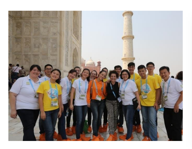
Group photo with the judges from Argentina in Taj Mahal