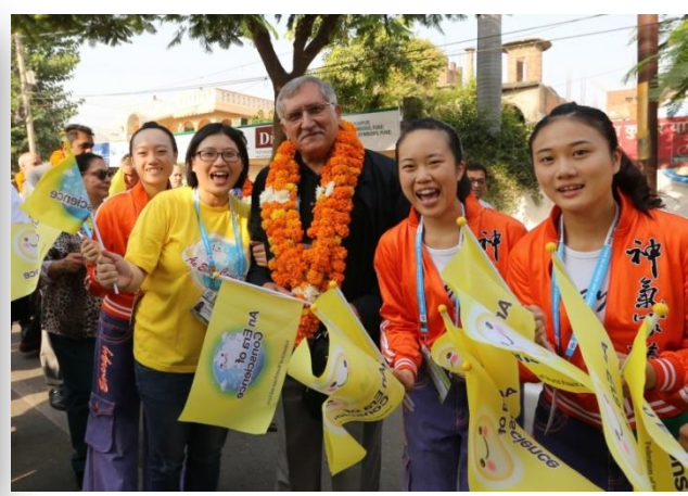
Volunteers taking a group photo with the Vice President of Cassation Act from Turkey.