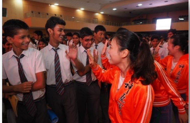
In City Montessori School, volunteers of "An Era of Conscience" spread positive energy and interact with the students.