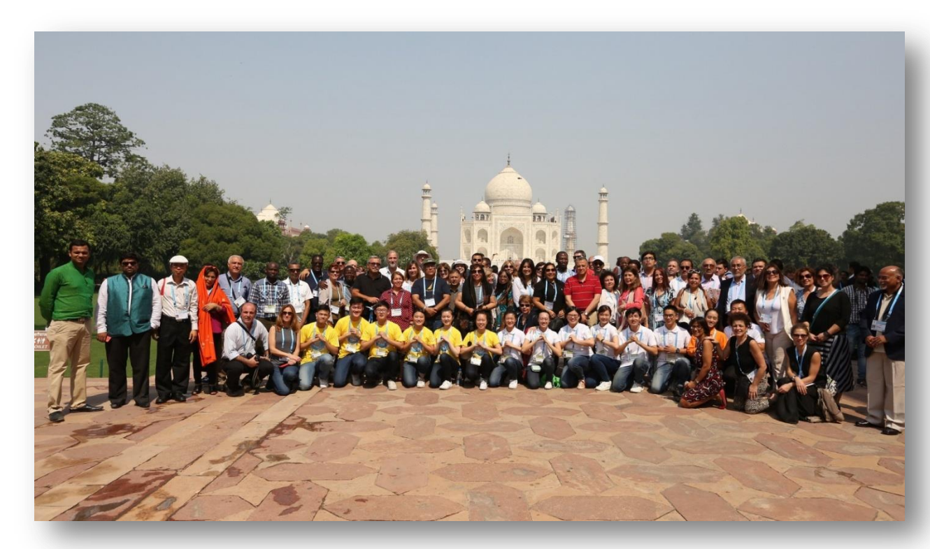
Volunteers of An Era of Conscience and judges together visiting Taj Mahal, one of the 7 wonders of the world

In the 16th International Conference of Chief Justices of the World, international youth volunteers from Federation of World Peace and Love, Association of World Citizens, and Tai Ji Men Qigong Academy spread neverending energy around and during the conference. They use their energy to bring laughter and happiness to everyone in everywhere they go. They not only learn from those judges of 60 different countries, but also use love to interact, share and discuss the idea of love and peace with each other. Every smile and hug connect their hearts more closely. They cross the language barrier to build up cross-generation friendships.