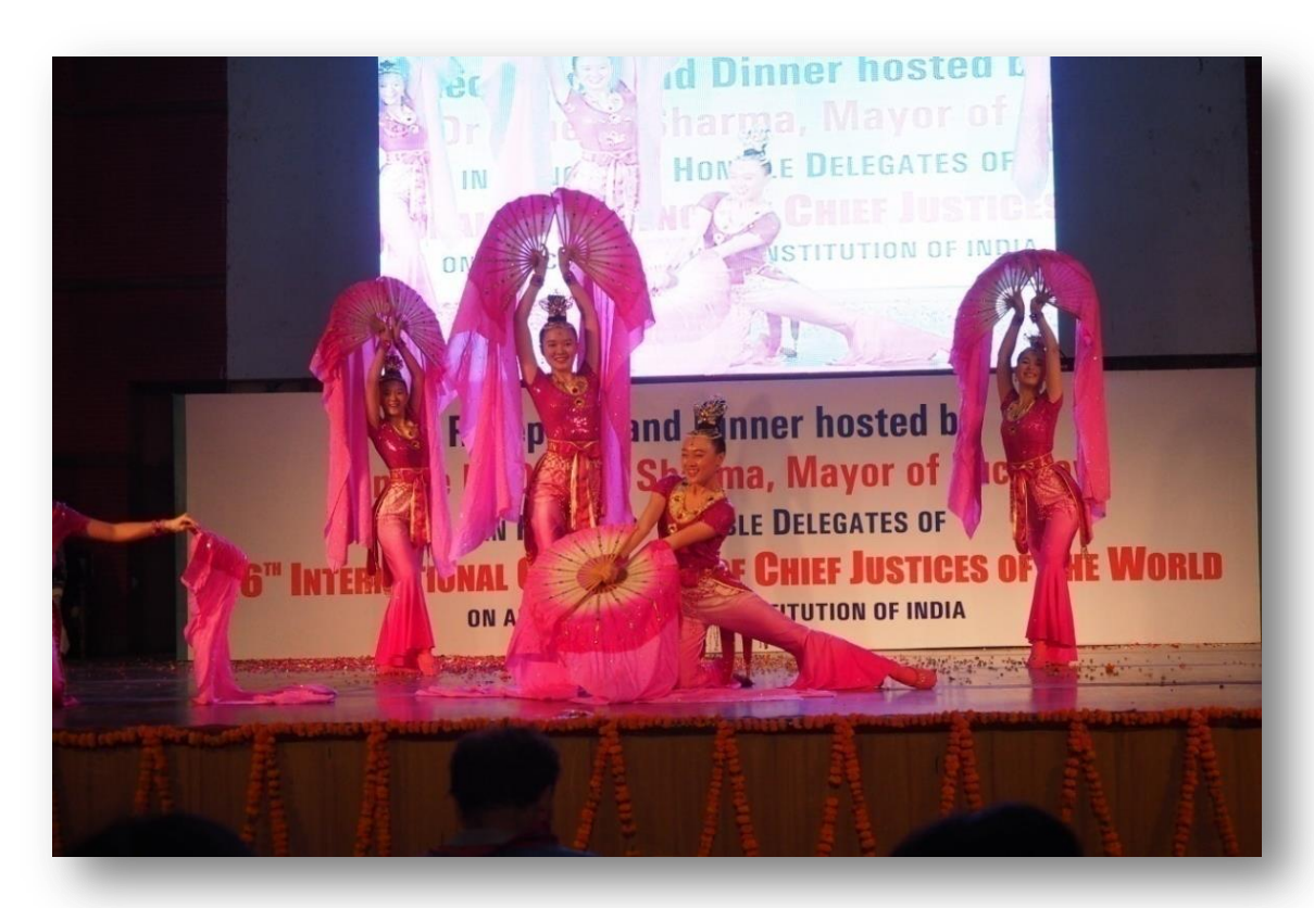
Female dizis of Tai Ji Men spread propitious blessings through their wings as phoenixes, blessing prosperity and harmony in earth.