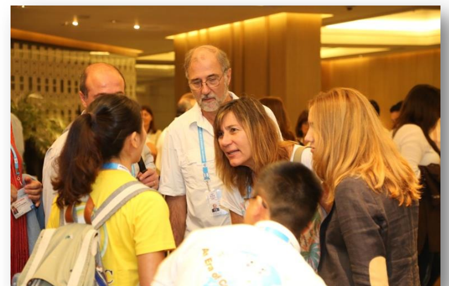
Judges from Argentina