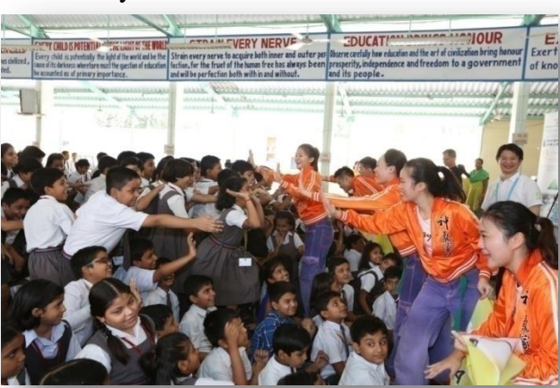
Volunteers spread their energy and happiness through their energetic performances to City Montessori School, creating enthusiastic atmospheres and interactions.